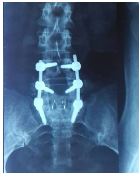
Figure 3: Postoperative lumbar AP radiograph, after removal of the blade, showing S1 to L4 screw rod fixation with L5-S1 lumbar interbody fusion.

Lost broken objects can be usually retrieved in the same session, with enough time and patience allocating for this purpose. However, in rare instances even, despite consuming two to three hours additional operative time, retrieval might be impossible. In such instances further evaluation, for detection of the exact location of the broken object is necessary in which computerized tomography is the choice to locate the foreign body. In most of unsuccessful attempts, the broken object is hidden in extreme lateral portion of the disc space as it happened in our case. Review of the literature shows that in most of the cases in which reoperation is indicated the broken object is hidden in extreme lateral location, which make their visualization and removal quite difficult [4,5].